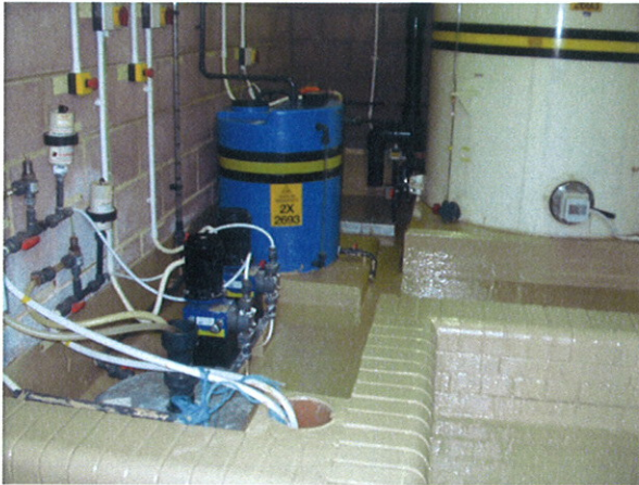
SWA – Halling, Kent - Treatment works