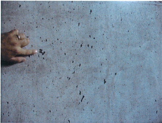
(Surface after preparation – pore holes)