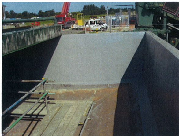
(Chemical resistant coating applied)