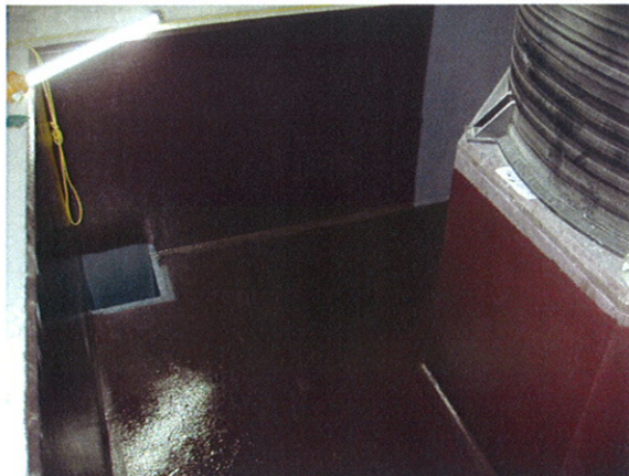
(Second coat applied – Red)