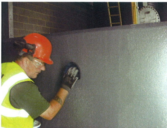
(De-nibbing first coat)