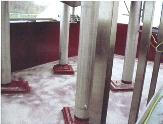
TWA – 5 sites - Chemical storage tank bunds