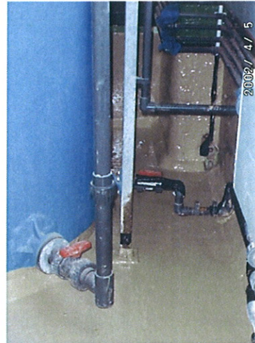
SWA – Twyford WTW bund coating