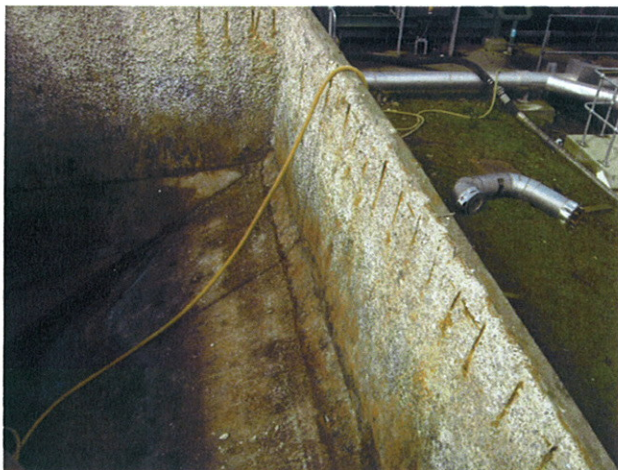
(Concrete condition after surface preparation)