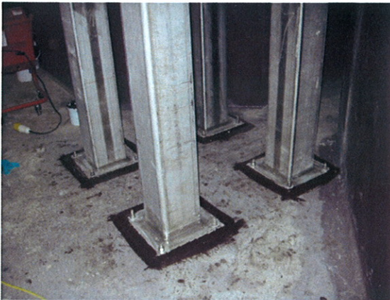
(Epoxy fillet & coating to tank support legs)