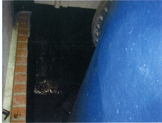
TWA – Cleeve – WTW – bund