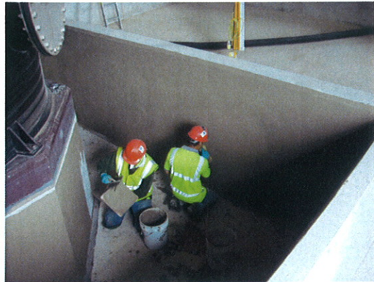
(Repairs to concrete surface)