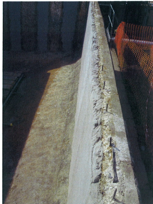
(Repairs in progress)